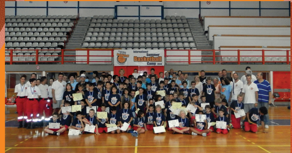
Promitheas/Nesodden, end of summer camp 2014 photo.