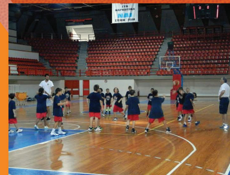
Young participants are working on a passing drill.